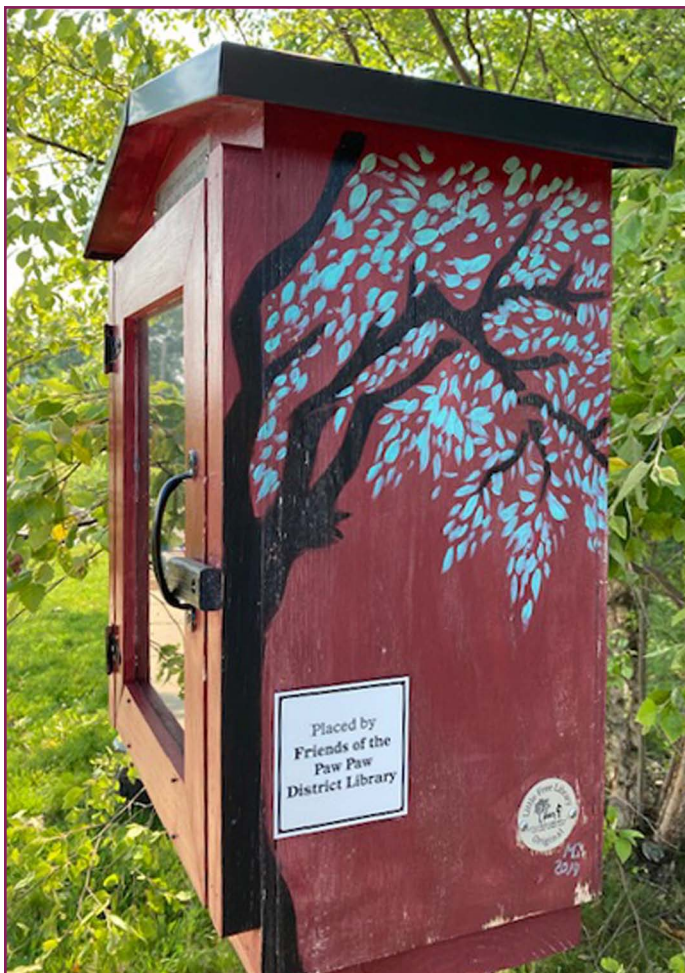
Our group now maintains two Little Free Libraries in Paw Paw. The original box (above) is located outside Paw Paw Brewing Company (780 S. Gremps St.). More recently a second box (below) was installed between the Paw Paw Village Hall and the Strand Theater (~113 E. Michigan Ave.).